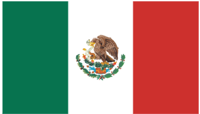
National emblem of Mexico