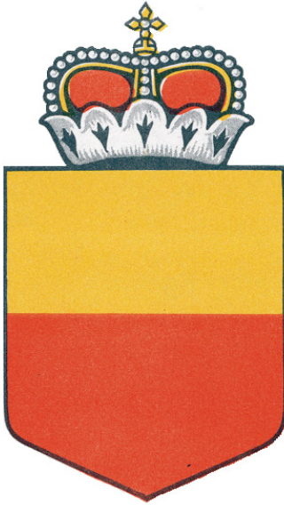
National emblem of Lichtenstein