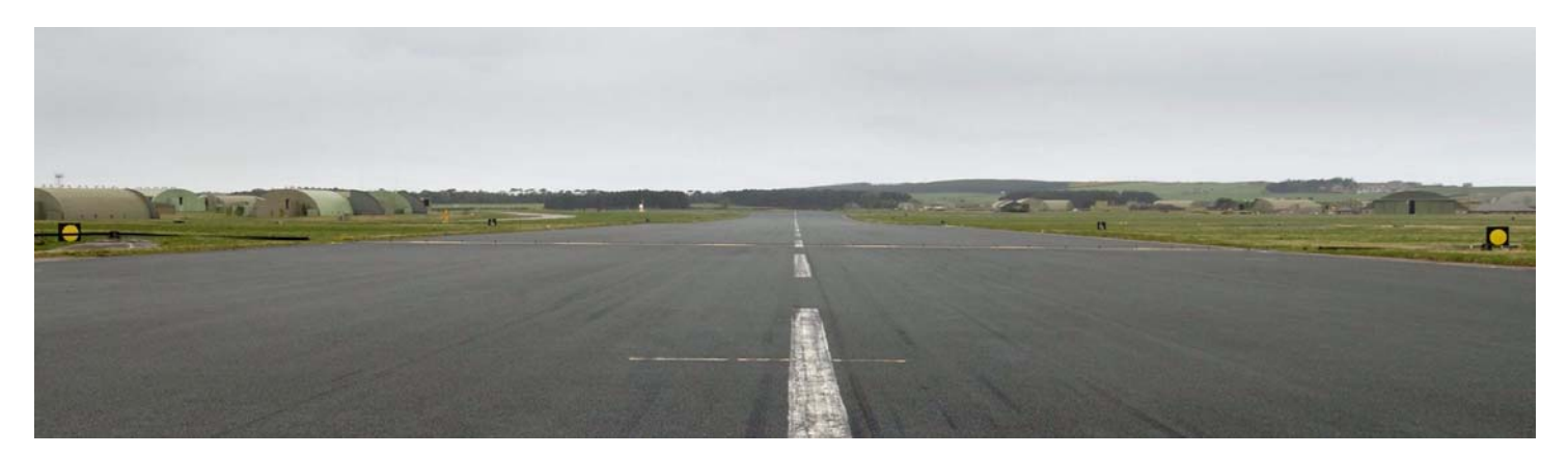
RHAG from threshold

d. There may be an "arrester (or jet) barrier" positioned at or beyond the end of the runway. Unlike a cable, this is for emergency use only and does not affect the runway itself. However, an "up" overrun barrier is a 20 foot obstacle affecting the climb after take-off or go-around. If for some reason the approach end barrier is up, it forms a significant obstruction. Propeller driven aeroplanes should not attempt to use an arrester barrier as an aid to stopping in an emergency.